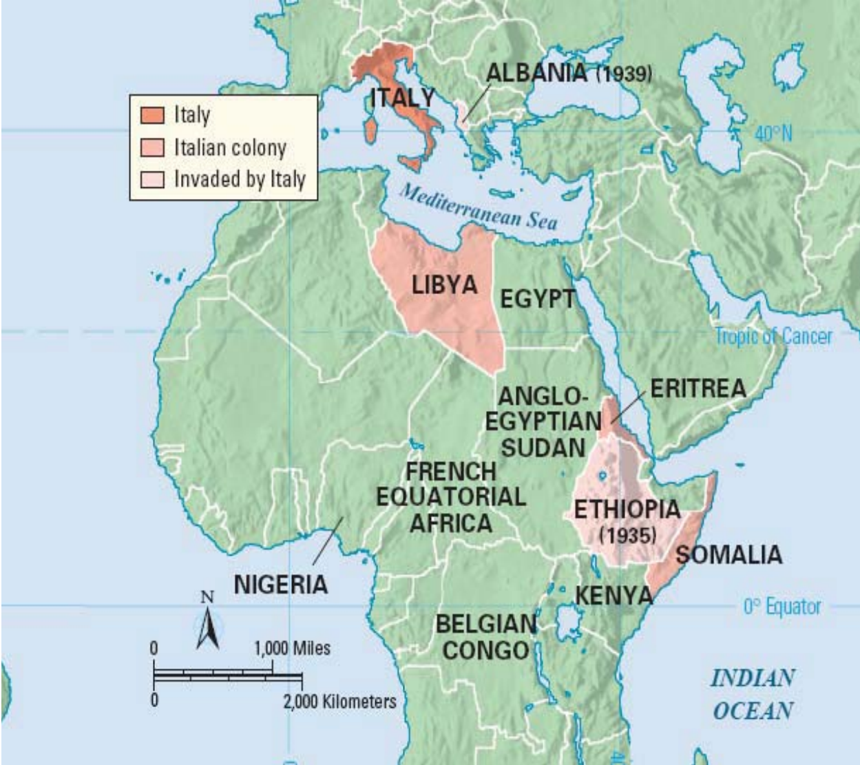
Map of Africa (1939)