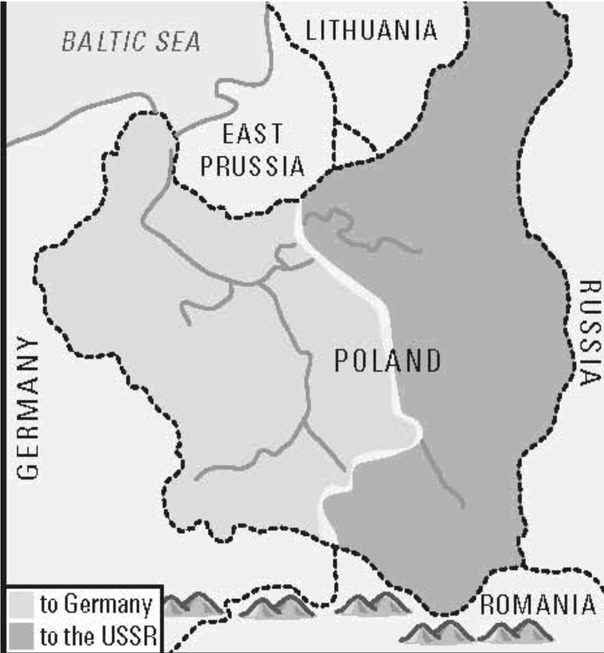
Map of the 1939 Partition of Poland