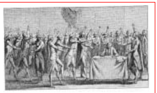
Source B. Members of the Third Estate swearing not to separate until they have given France a constitution.

The deputies of the third estate, having grown tired of the arguments over how each order should vote, declared themselves a <u>'national assembly'</u>. They represented 96% of the population and felt that they were the 'true' parliament. They wanted to draw up a <u>constitution</u> showing how France was to be governed.